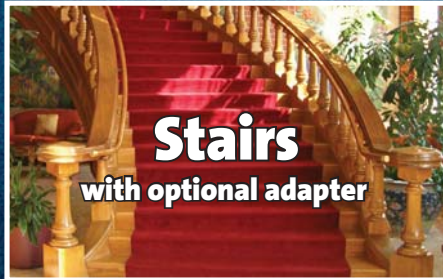
Stairs with optional adapter